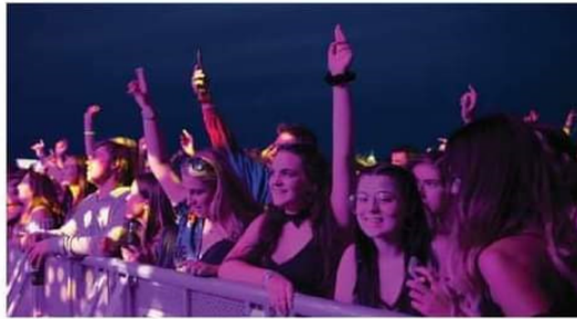
■ The new lobby group has been formed by 16 businesses involved in the entertainment, events and nightclub sectors

The requirements for the scheme included a minimum annual turnover of